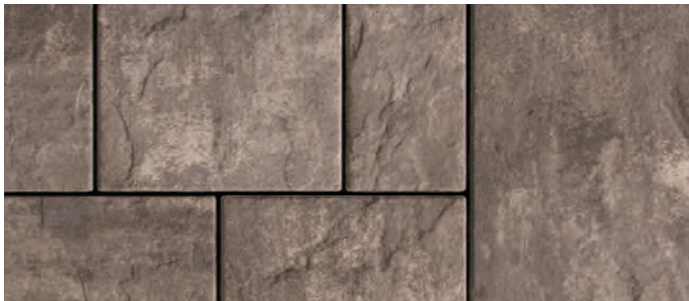
OAK BROWN FUSION