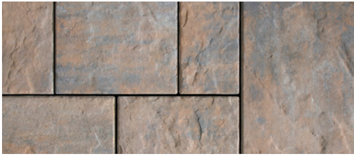
ALMOND GROVE FUSION