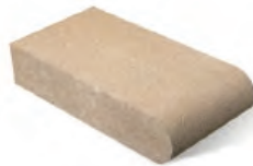
NON-ANTIQUED 5 7 / 8 x 11 1 / 2 x 2 3 / 4 " 150 x 300 x 70mm