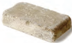
STANDARD 5 7 / 8 x 11 1 / 2 x 2 3 / 4 " 150 x 300 x 70mm