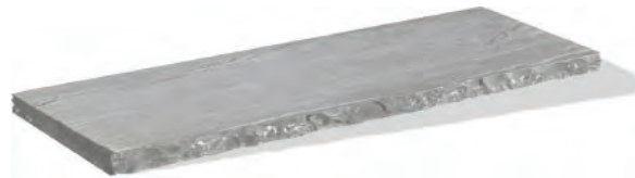
6' LENGTH 14 x 72 x 2" 360 x 1830 x 50mm