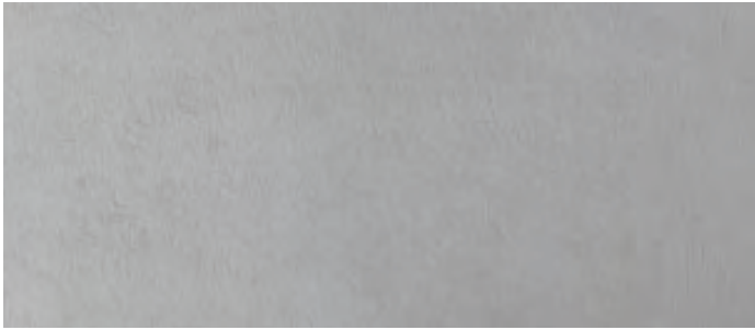
GREYFIELD Available in Rock Face and Smooth

INDIAN COAST / GREYFIELD / STONECLIFF GREY - SANDSTONE