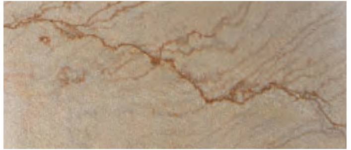
INDIAN COAST Available in Rock Face and Smooth