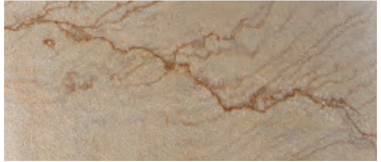
INDIAN COAST Available in Rock Face and Smooth