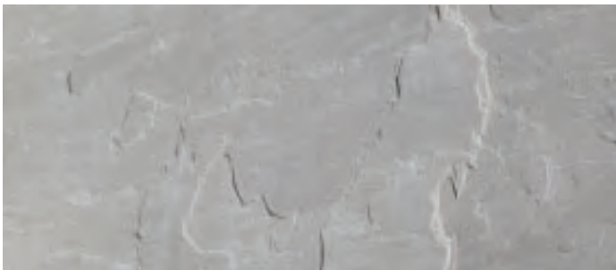
STONECLIFF GREY Available in Rock Face only