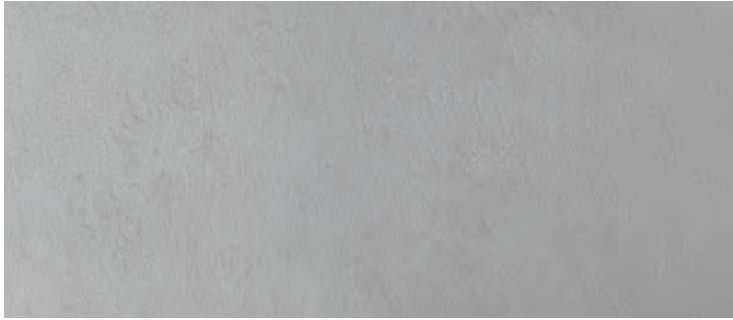
GREYFIELD Available in Rock Face and Smooth

INDIAN COAST / GREYFIELD / STONECLIFF GREY - SANDSTONE