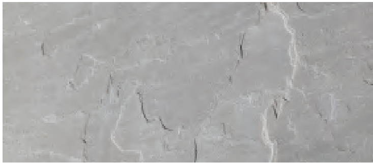
STONECLIFF GREY Available in Rock Face only