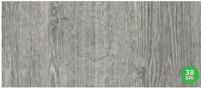
DOLOMITI GREY DELCONCA

CERAMICHE · CÆSAR · LA CULTURA DELLA MATERIA