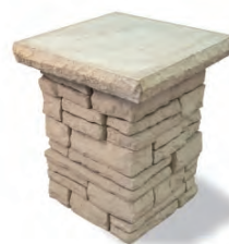
COMPLETED UNIT SHOWN