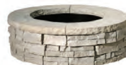
RIVERCREST FIREPIT KIT Unilock Reduced Smoke insert option also available. See page 171.